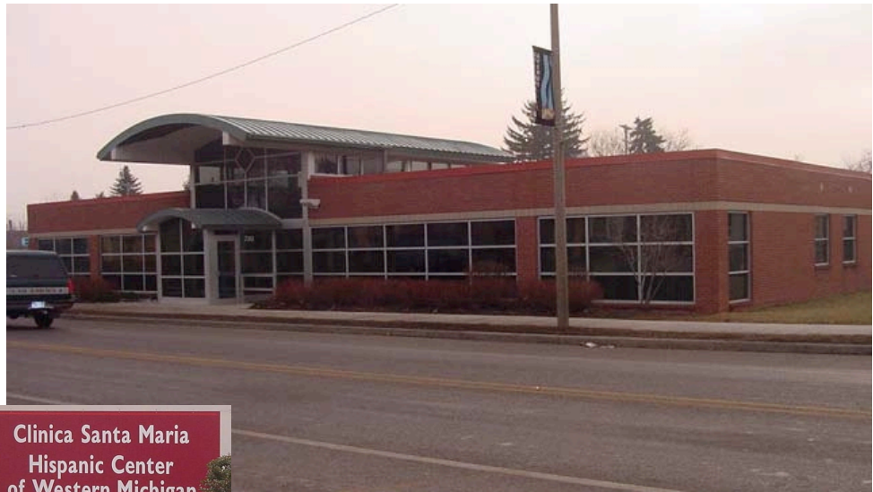
Clinica Santa Maria Hispanic Center of Western Michigan

Clinica Santa Maria St. Mary's Health Services Grand Rapids, Michigan