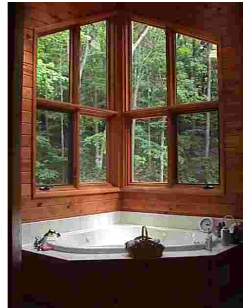
Tub at Master Bath