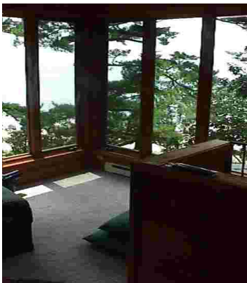
Views from Look-out Level