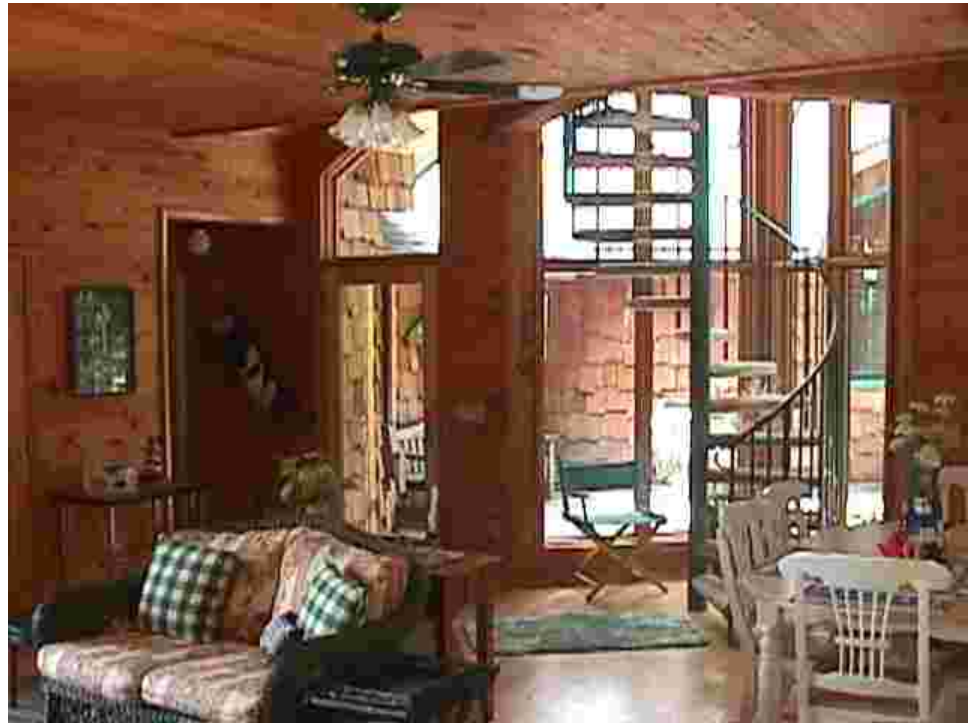
Interior - looking at spiral stair